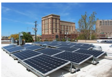
The Flicks installed 96 solar panels on its roof.

expected. Twenty-five percent of the power used by The Flicks is generated by the solar panels.