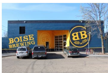
Boise Brewing added a sprinkler system.

Boise Brewing (formerly Bogus Brewing) added a wet fire sprinkler system and increased the safety and flexibility of the 3,463-square-foot building.