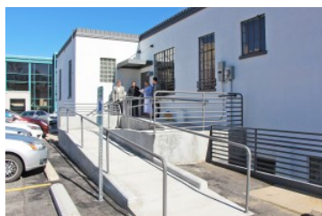
Henriksen/Butler added wheelchair access ramps to its building.

Henriksen/Butler, a Salt Lake City-based contract furniture dealer, was honored for adding wheelchair ramps to the rear of the 1939 building that originally housed the John Regan Post No. 2 American Legion Hall. Clear access for electrical equipment conflicted with original ramp design and it was difficult to get parking spaces close to the ramp. Henriksen/Butler maintained the building's Art Deco exterior, including original windows, and integrated accessibility with the building's historic nature.