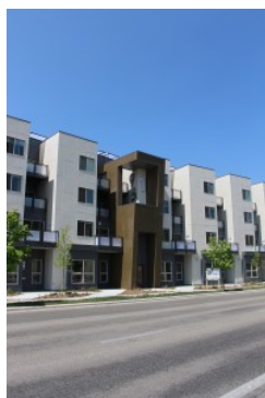
The 951's contemporary design caught the eye of city and BOMA judges.

exterior wall modulation, clean wall planes with fields of similar colors and three different panel exterior systems that create visual interest.