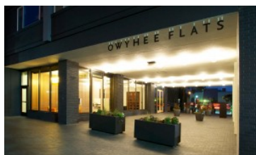
The Owyhee added 36 apartments to its mixed-use redevelopment of the historic hotel.

Boise Mayor David Bieter selected The Owyhee's transformation from hotel into a mixed-used project as the best overall project completed in Boise between June 2014 and May 2015. The 105-year-old building was converted into street level restaurant and retail space, event space, business tenant space and 36 market-rate apartments. Many of the original features of the building were uncovered in the remodel of the building and incorporated into its new design.